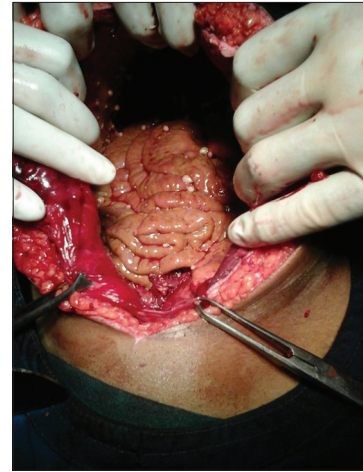
Figure 1: Ascitic fluid

Histopathology of the lesion confirmed benign cystic teratoma of the ovary with chronic non-specific inflammatory pathology. Ascitic fluid was negative for malignant cells.