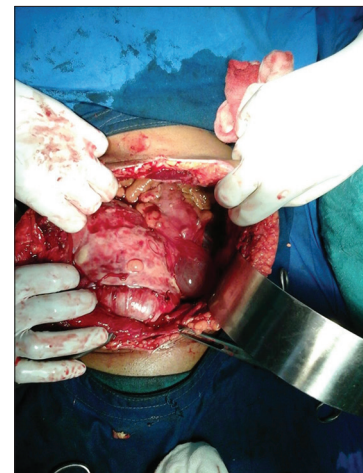
Figure 2: Adhesions were present with restricted mobility