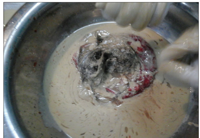
Figure 3: Cut section of the specimen showing cyst consisting of sebaceous material with tuft of hair and multiple teeth

Cystic fluid showed occasional degenerated cells over a proteinaceous background which gave the impression of oleo-keratin granulomatosis. The patient was discharged on the 8 th post-operative day. Her post-operative period was uneventful.